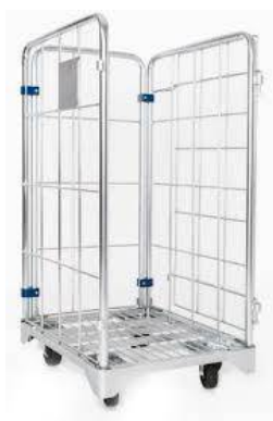
DIRTY TROLLEY ENTRANCE